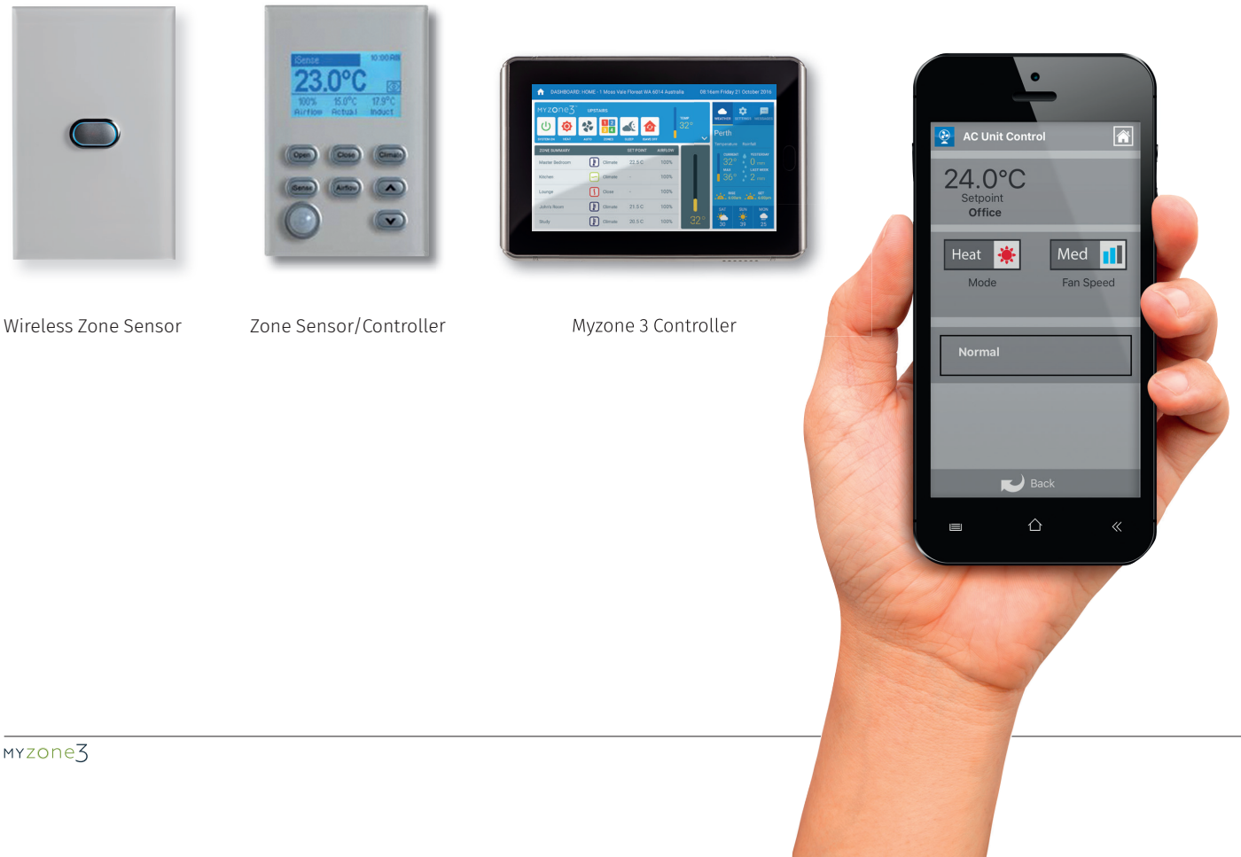
Wireless Zone Sensor Zone Sensor/Controller Myzone 3 Controller

Myzone offers an easy to use App which enables you to control your air conditioning system via your smart phone or tablet. This App gives you even greater control with 4G access from anywhere providing savings and a more efficient solution. Now the whole family can come home to the perfect temperature.